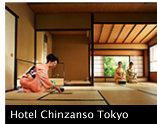
Hotel Chinzanso Tokyo