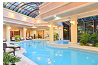
Hotel Chinzanso Tokyo

Address: 2-10-8 Sekiguchi, Bunkyo-ku, Tokyo 112-8667