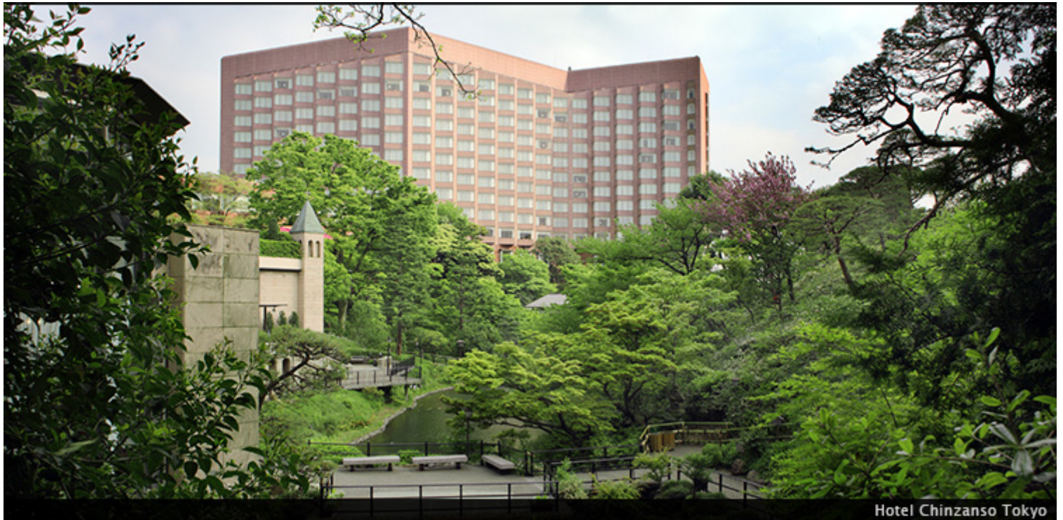
Hotel Chinzanso Tokyo