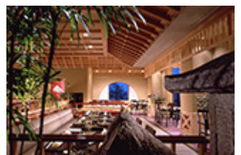
Hotel Chinzanso Tokyo