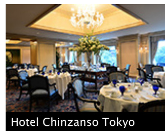
Hotel Chinzanso Tokyo