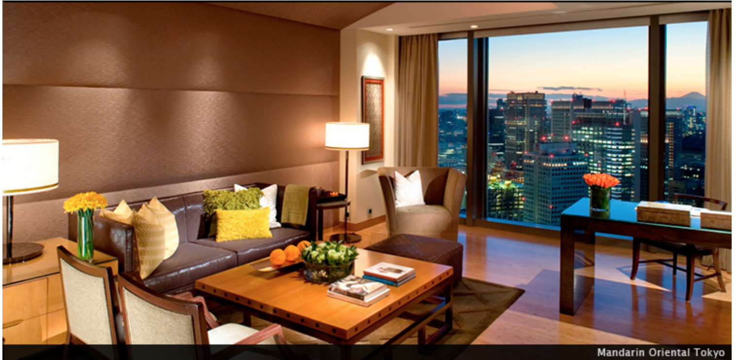
Mandarin Oriental Tokyo