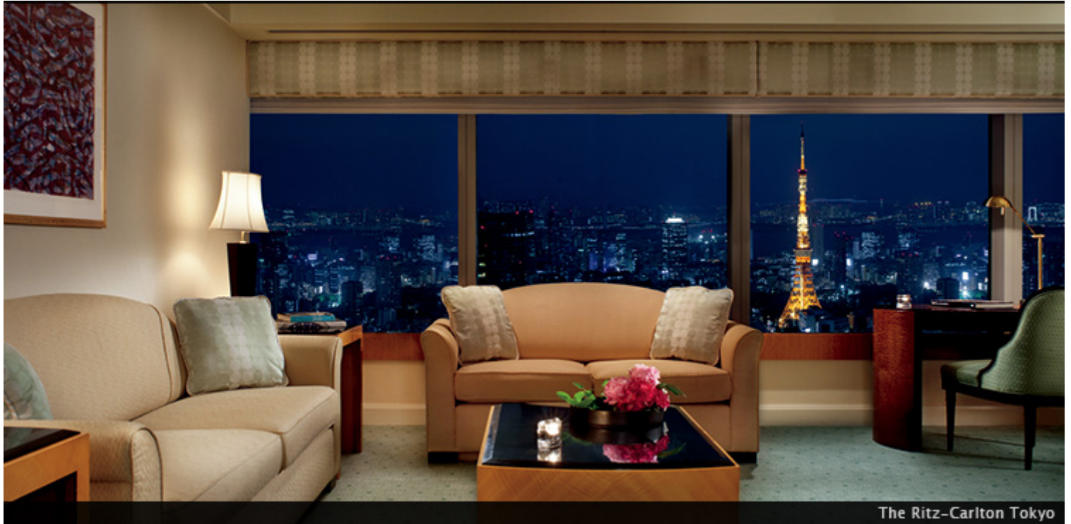
The Ritz-Carlton Tokyo