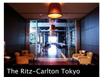
The Ritz-Carlton Tokyo