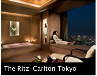
The Ritz-Carlton Tokyo