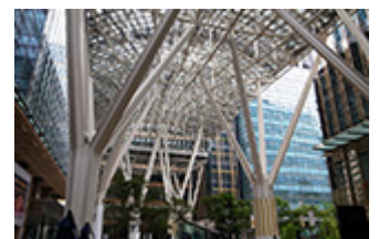
The Ritz-Carlton Tokyo