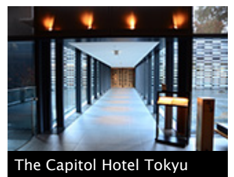
The Capitol Hotel Tokyu