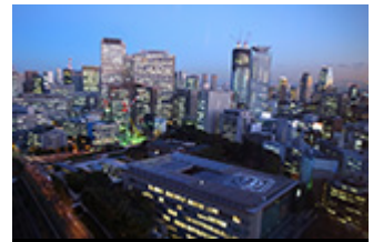
The Capitol Hotel Tokyu

Address: 2-10-3 Nagata-cho, Chiyoda-ku, Tokyo 100-0014