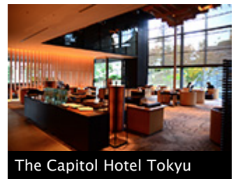
The Capitol Hotel Tokyu