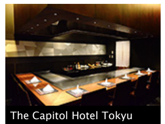
The Capitol Hotel Tokyu