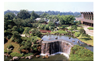
Hotel New Otani Tokyo

Address: 4-1 Kioi-cho, Chiyoda-ku, Tokyo 102-8578