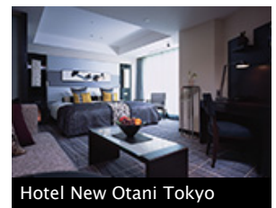
Hotel New Otani Tokyo