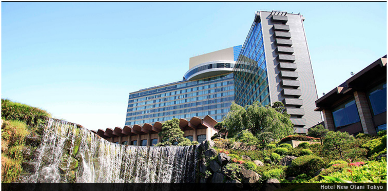
Hotel New Otani Tokyo

Unparalleled service and hospitality for more than 100 years, JTB Luxury Escapes is the ultimate choice going to JAPAN.