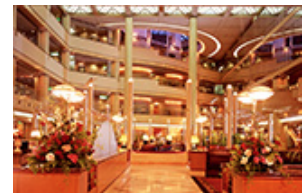
Hotel New Otani Osaka