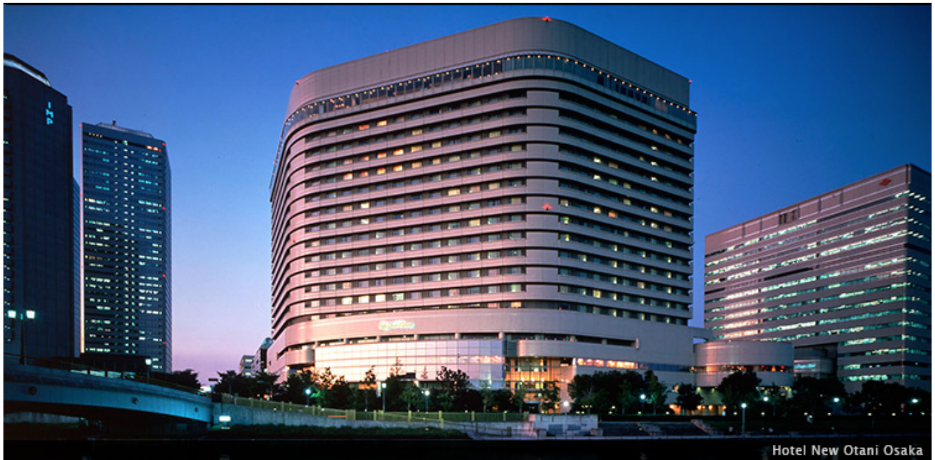
Hotel New Otani Osaka

Unparalleled service and hospitality for more than 100 years, JTB Luxury Escapes is the ultimate choice going to JAPAN.