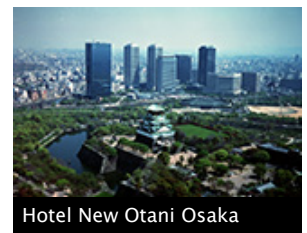
Hotel New Otani Osaka