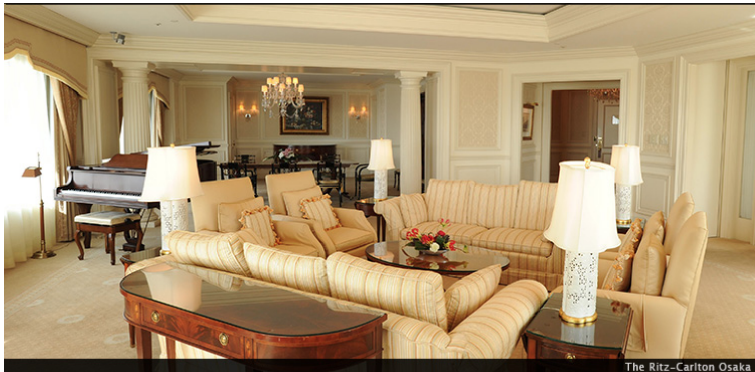
The Ritz-Carlton Osaka