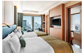
The St. Regis Osaka

Address: 3-6-12 Honmachi, Chuo-ku, Osaka 541-0053