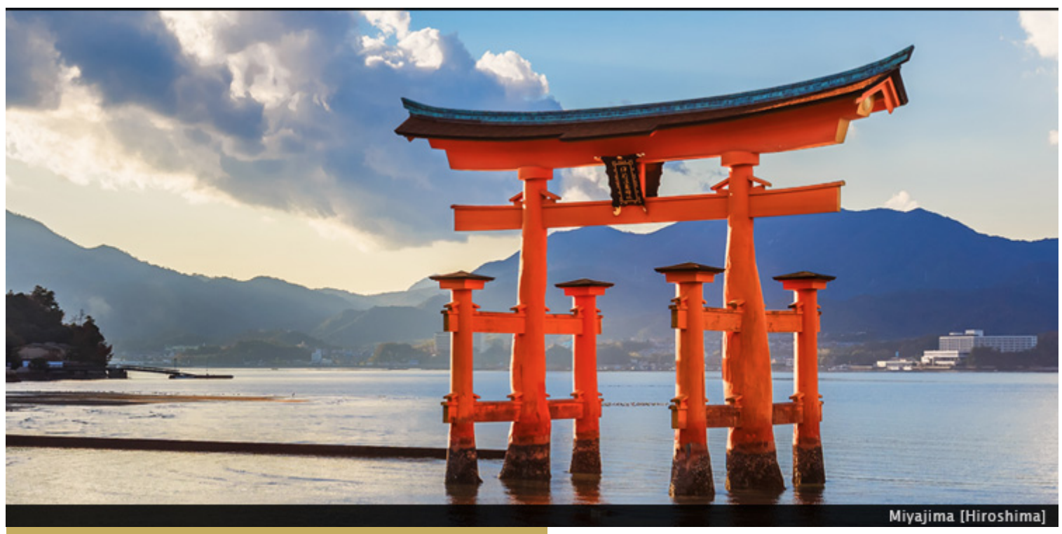
visit | Hiroshima, Okayama, Matsue, Naoshima