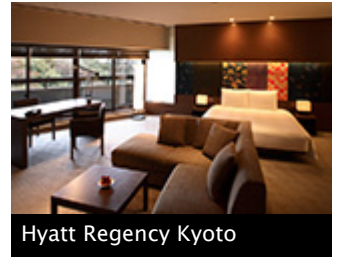
Hyatt Regency Kyoto