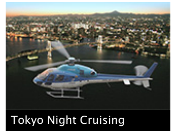
Tokyo Night Cruising