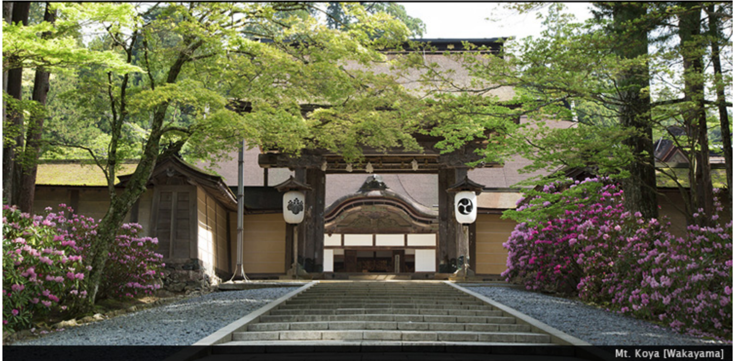
Mt. Koya [Wakayama]