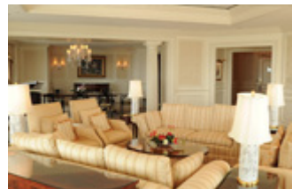
The Ritz-Carlton Osaka

Koyasan is one of the three most holy Buddhist sites in Japan along with Hieizan of Kyoto and Osorezan of Aomori. It is the head temple of the Shingon sect of Buddhism, established by Kobodaishi (also known as Kukai), and is a treasure trove of the sect, counting 117 Tacchu Temples and over 40,000 cultural properties.