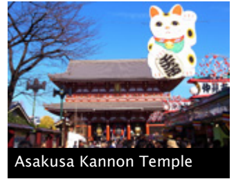
Asakusa Kannon Temple