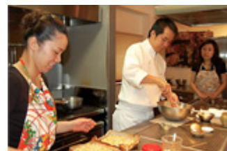
Japanese cooking lesson

Visit some of the most important sites in Tokyo, Kyoto and Nara. Participate in a special cooking class thought by a Michelin rated chef, private Tea Ceremony, Sword lesson and meet with a Noh expert.