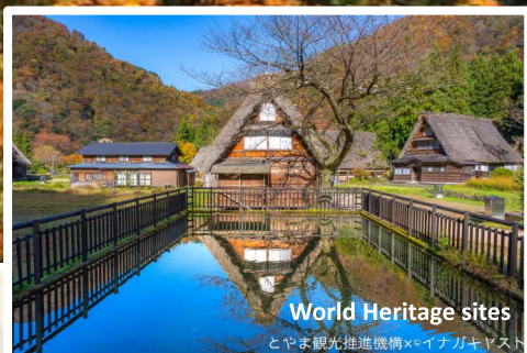
World Heritage sites