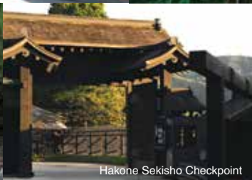
Hakone Sekisho Checkpoint