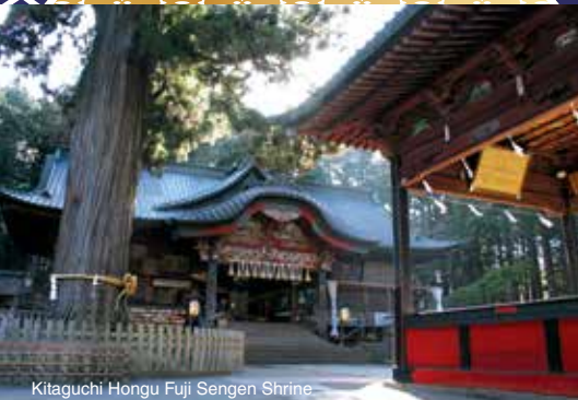
Kitaguchi Hongu Fuji Sengen Shrine