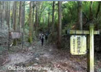
Old Tokaido Highway